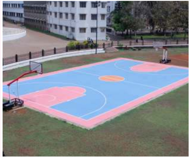
BASKET BALL GROUND